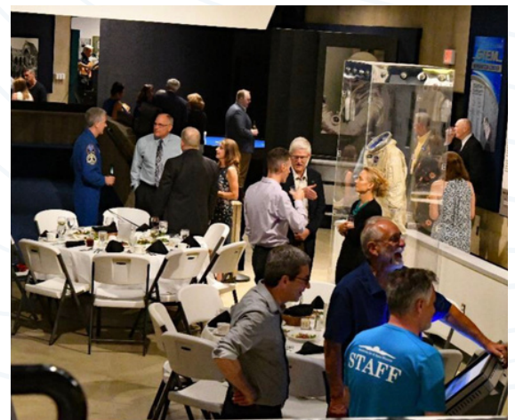
The Early Gallery with tables & chairs