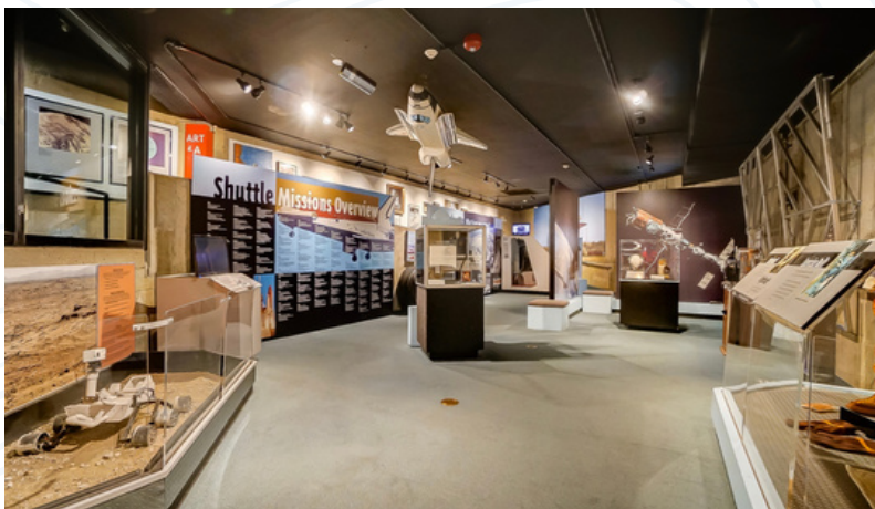
The Modern Space Gallery