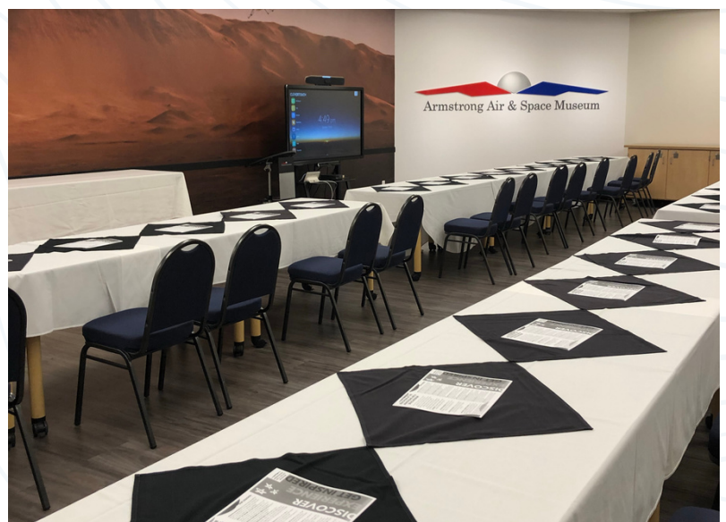
STEM Center with linens & chairs