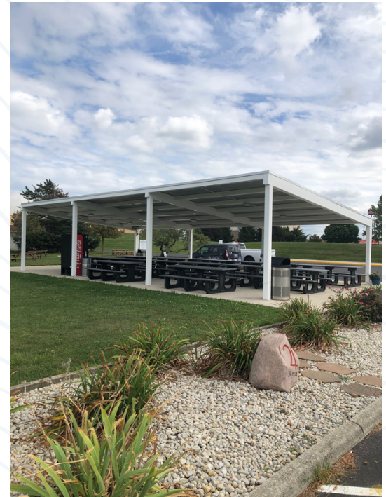
Tranquility Base Outdoor Pavilion

-Looking to rent our outdoor pavilion? Ask for a quote from our experience coordinator!