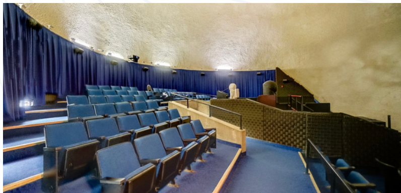
Museum's Astro-Theater, seats 75